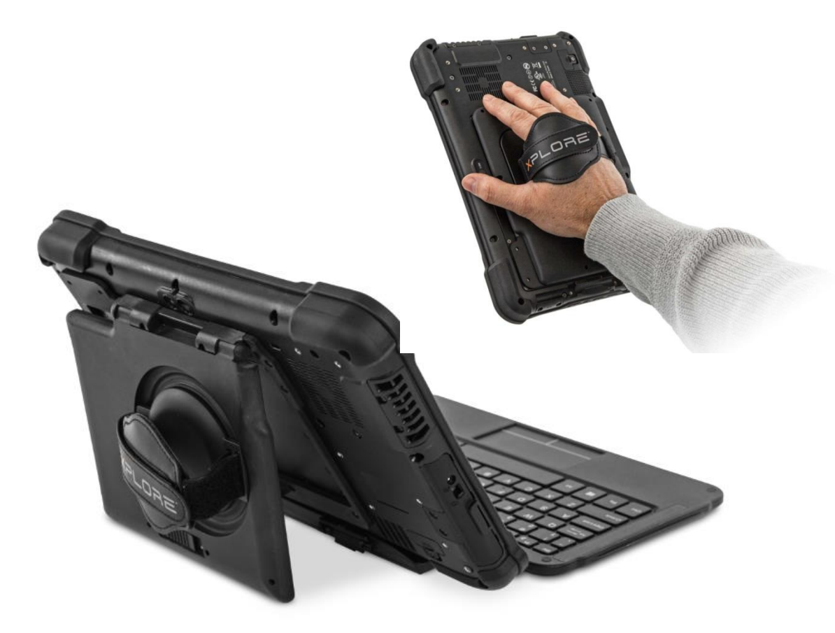
Part Numbers: 410055 (L10 KickStrap kit)

This combined Kickstand and Rotating Hand Strap provides working comfort for all Zebra L10 rugged tablet models in the field and at a desk. The integrated Kickstand closes tightly when workers are on the move, enabling access to the Rotating Hand Strap, which can be adjusted for hand size as well as unique rotation angle.