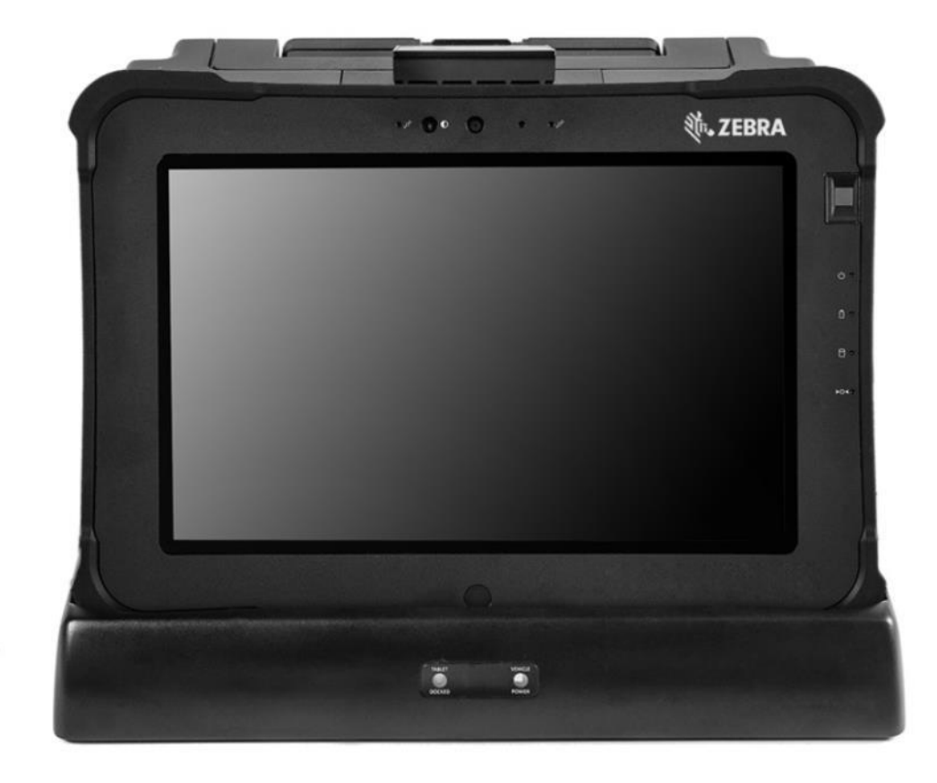
Part Numbers: Contact Zebra for product availability

Even mobile workers need to be in the office at some point. With the Office Dock, it is easy to transform your Zebra L10 rugged tablet into a full desktop configuration complete with HDMI and VGA video connections; 2 USB 3.0 ports, 2 USB 2.0, headphone, mic, and Gigabit Ethernet. Charge a spare standard battery or extended battery in the optional battery charger. The 90 watt AC adapter ensures both the tablet battery and the spare battery charge simultaneously. The L10 office dock has tablet alignment features designed for easy, one-handed insertion into the dock, and the dock can be securely mounted to the desk. (Compatible with all L10 Platform models)