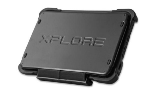
Keyboard in closed position via magnets, protecting display glass